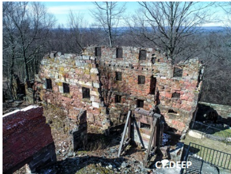
Old Newgate Prison

Old New-Gate Prison in East Granby - open Thursday- Monday, Old New-Gate Prison & Copper Mine is nationally recognized as the first chartered copper mine and first state prison in early America.