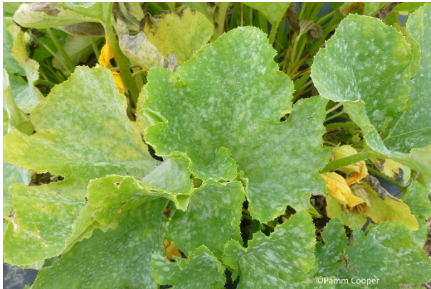
Powdery mildew on squash