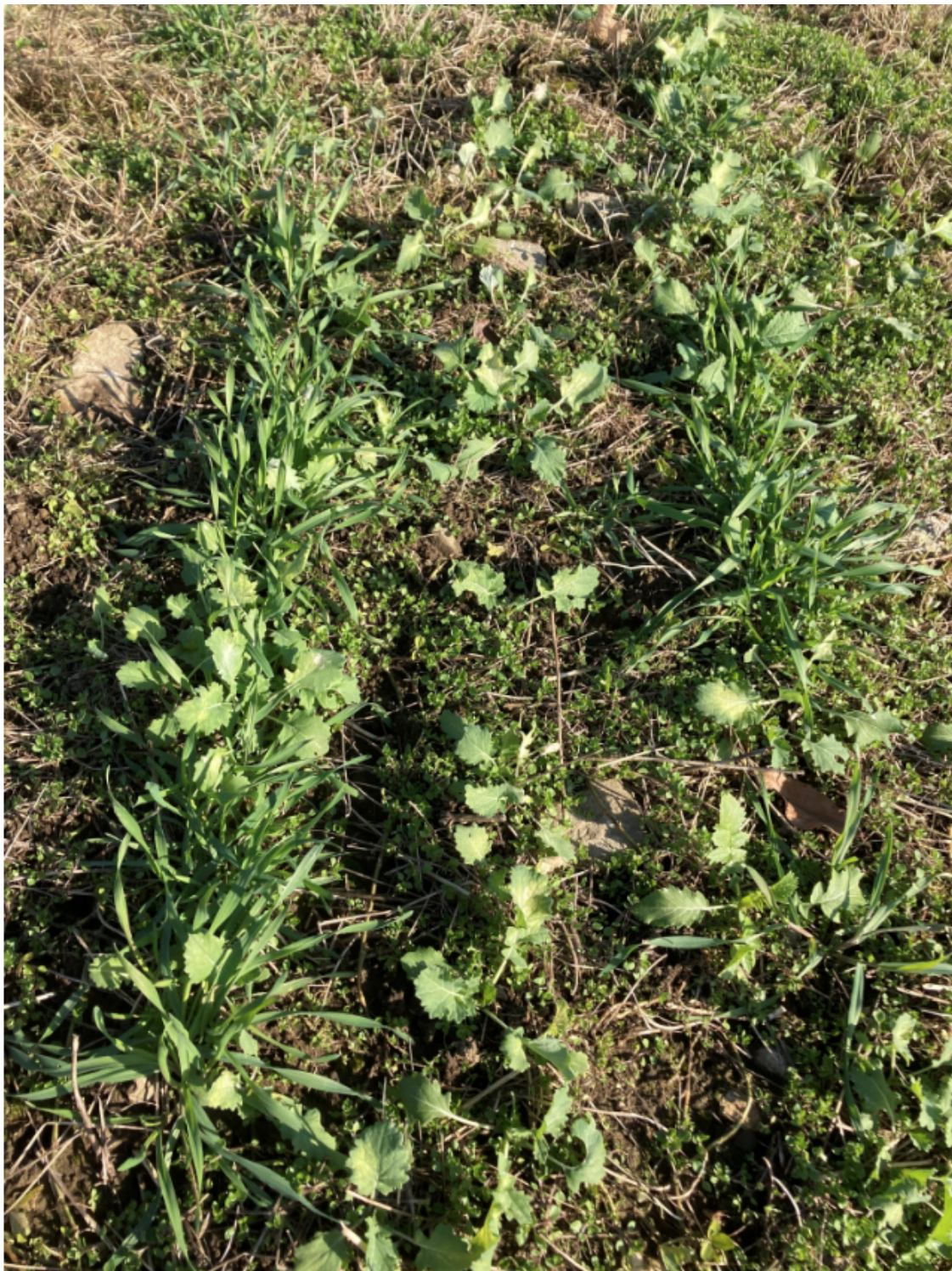
Mixture of cereal rye and daikon radish. Photo by Nora Doonan, UConn Cover Crops Offer a Number of Beneficial Ecosystem Services