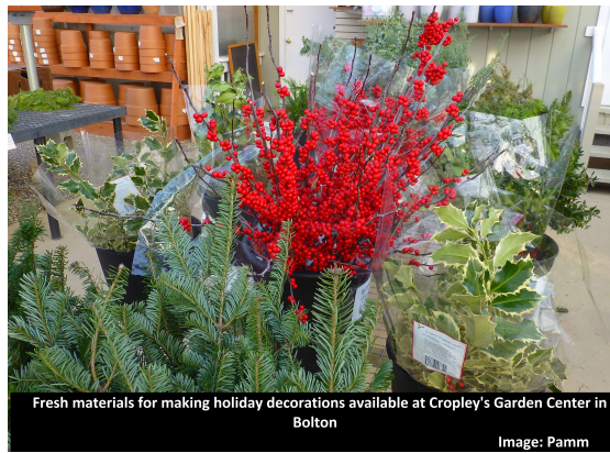
Fresh materials for making holiday decorations available at Cropley's Garden Center in Bolton