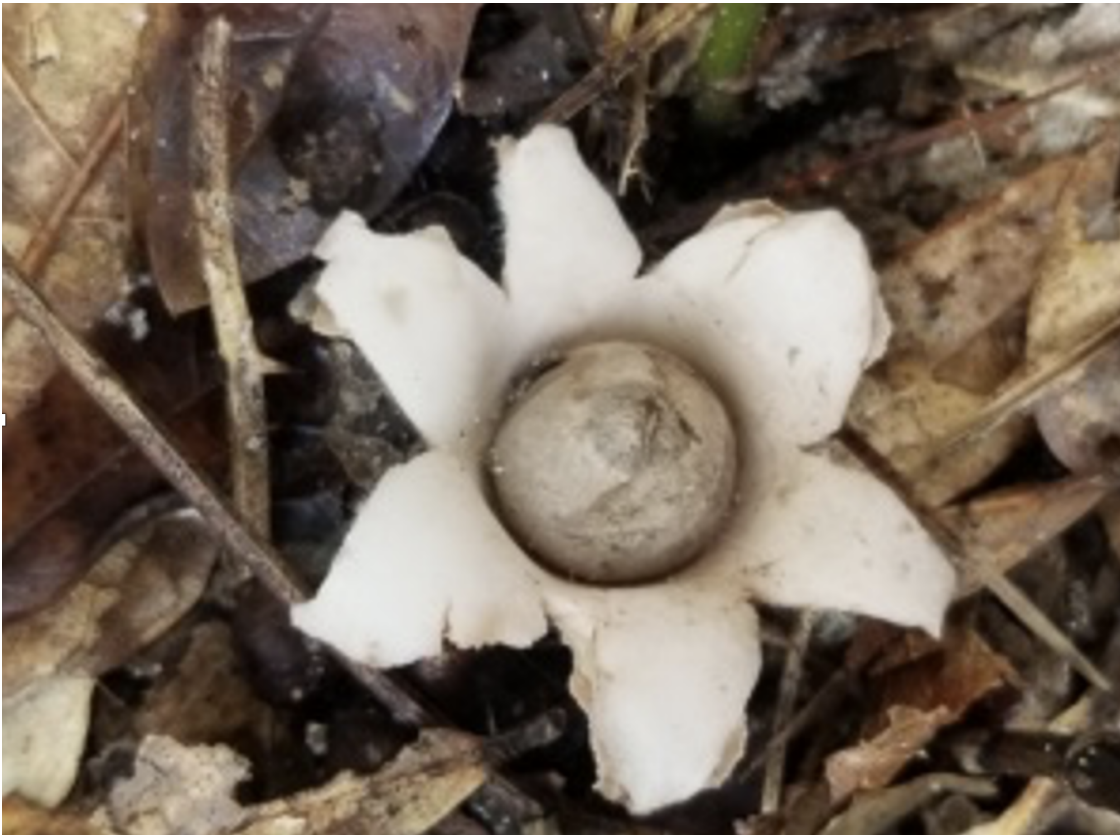
Earth Star