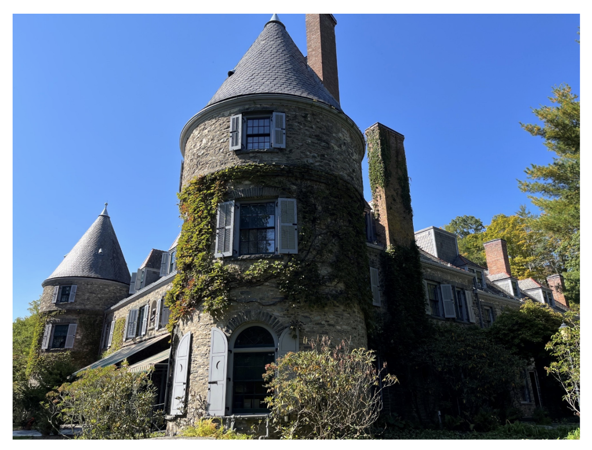
Grey Towers Historic Site in Milford, PA.