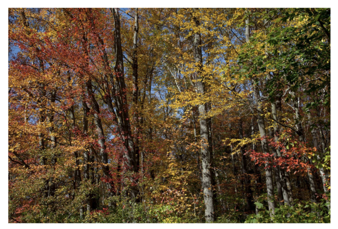
Highsmith, C. M., photographer. (2011) Fall in Connecticut. United States Connecticut, 2011. October. [Photograph] Retrieved from the Library of Congress,