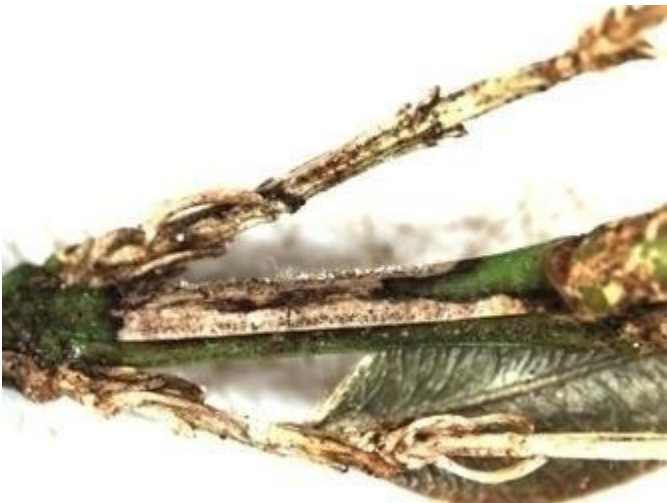
Symptoms Image by J. Allen