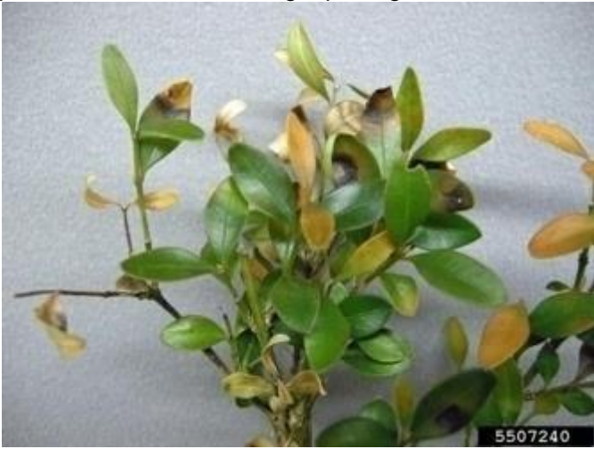
Leaf Spots

top to the soil line. Root infection does not occur. The most striking symptom is extensive defoliation. Favorable conditions are temperatures of 64-80°F and high humidity. Symptoms can be similar to those of other boxwood problems including Volutella blight, root rot, boxwood leafminer and winter injury. Volutella may occur on the same plant with the boxwood blight pathogen.