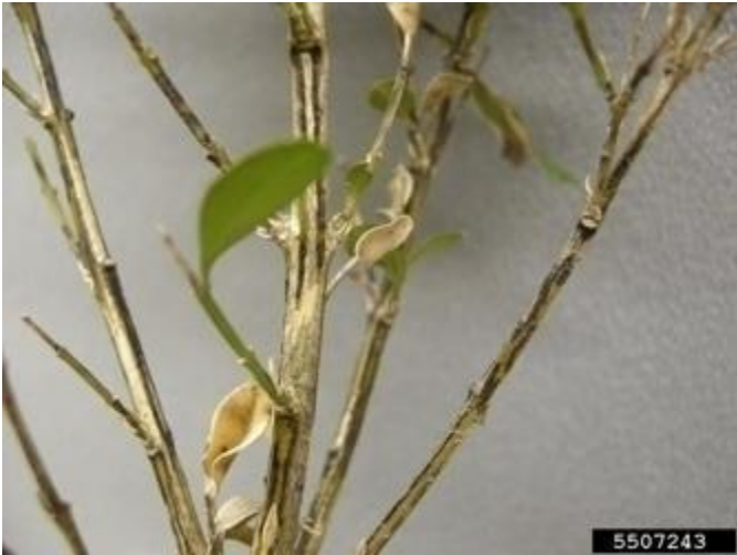
Stem Lesions