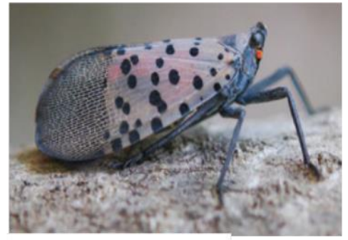
PA Department of Agriculture

The Connecticut Agricultural Experiment Station has issued a Quarantine Order with defined restricted areas for the exotic pest spotted lanternfly, Lycorma delicatula . The quarantine order was renewed January 1, 2022 and will remain in effect until December 31, 2022. The purpose of this quarantine is to attempt to stop the spread of this exotic, damaging pest.