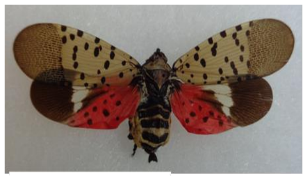
CT Agricultural Experiment Station