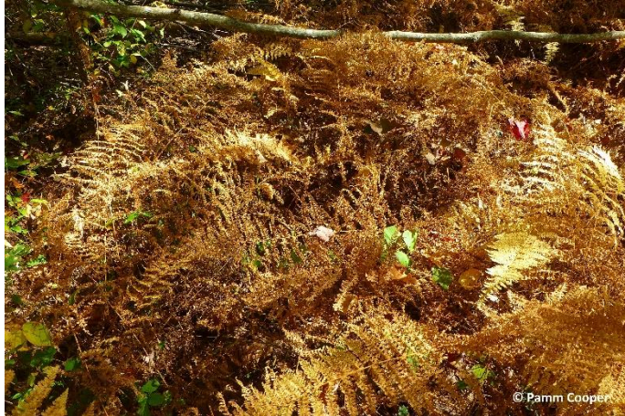
Native woodland ferns are crisp after a severe drought. Image was taken at James L. Goodwin State Forest