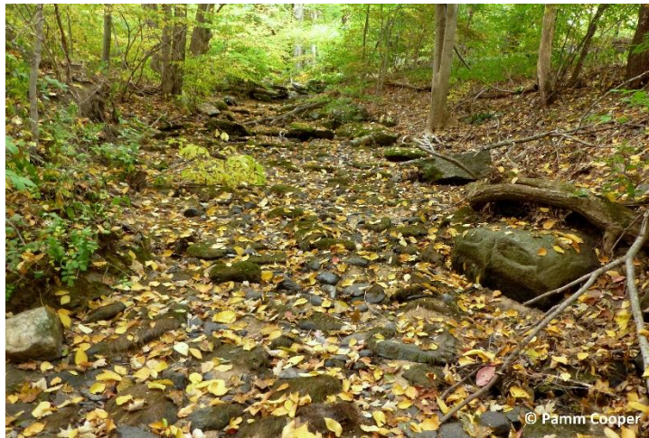
Completely dry stream bed in Glastonbury, Connecticut