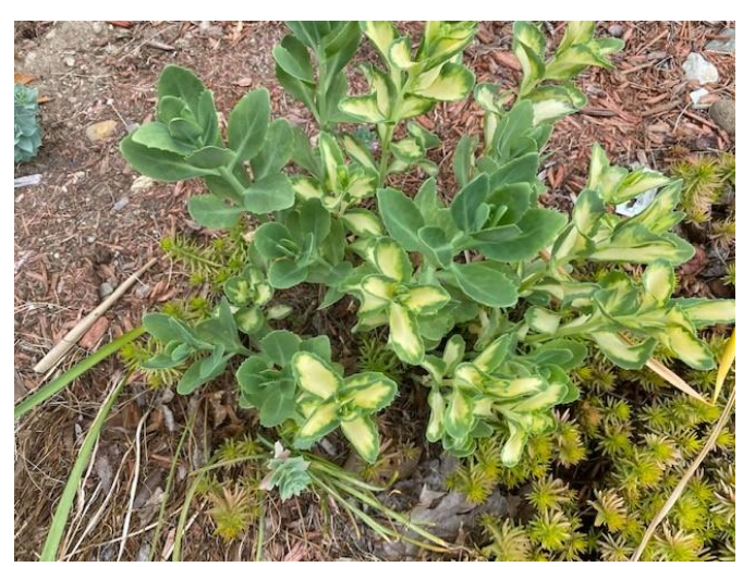
Variegated sedum with green shoots that should be removed.

Gardeners delighted by these unique variegated, dwarf and weeping plant forms are often dismayed to notice solid green leaves or full-size branches or even upright growths on their prized specimens. This is known as a reversion and is a natural process by which the cultivar reverts back to the original form found in its parentage.